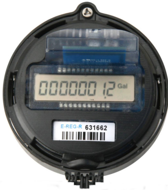
Innov8-VN with integral antenna

The innov8-VN is an electronic water meter register with an embedded cellular modem. This document provides details on the configuration, operation and installation of the device.