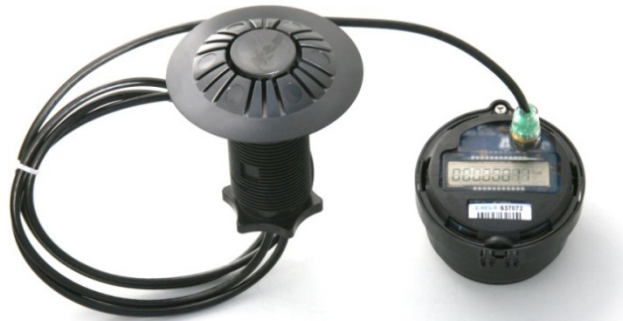
Innov8-VN with external antenna